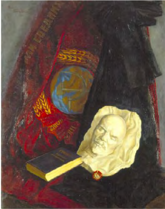
“In Memory of V.I. Lenin” F.G. Bogorodskii, 1934

newspapers in 1969 and again in 1985. 118 It portrays the death mask as a miracle-working relic, its sacred essence working to build socialism in Germany and inspire the devotion of the masses.