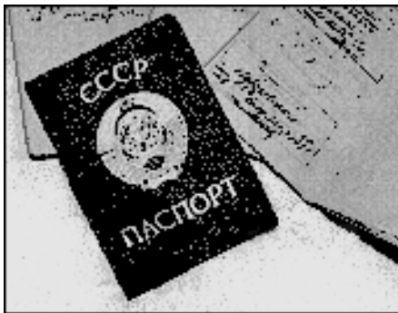
The Soviet internal passport

The strongest negative reactions to the new passport have come from the authorities of some of the federal republics (Russia today is made up of eighty-nine federal subjects; the highest status is enjoyed by the twenty-one republics, which are all ethnically defined.) The loudest voices have been those of the “usual suspects” when it comes to self-assertiveness, among these, the republics of the Volga region and the North Caucasus.