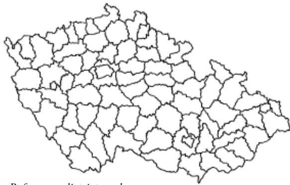
Before Reform — districts only