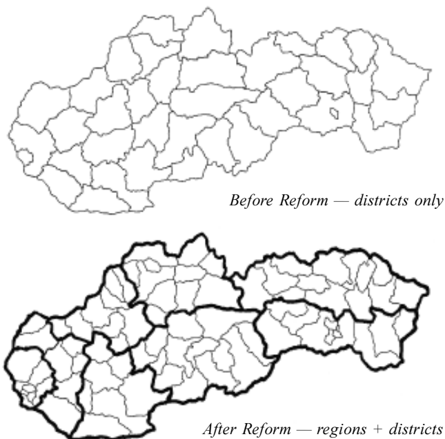
Figure 1: A Map of the Slovak Public Administration Before and After Reform (1996)

Thus, the political-electoral considerations of HZDS and its coalition partners took primary importance in implementing Slovakia's version of public administration reform. First, the government parties needlessly expanded the territorial administration in order to reward their members and supporters with appointments. This expansion