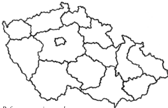
After Reform — regions only

enough to carry the day. On December 3, 1997, the Social Democrats took the parliamentary initiative, which led to the passage of a constitutional act creating 14 new regions. ODS succeeded in keeping the regions weaker than the Social Democrats would have liked, but it was no longer able to block their creation. As I mentioned above, ODS was also able to exact the concession of eliminating the district level public administration.