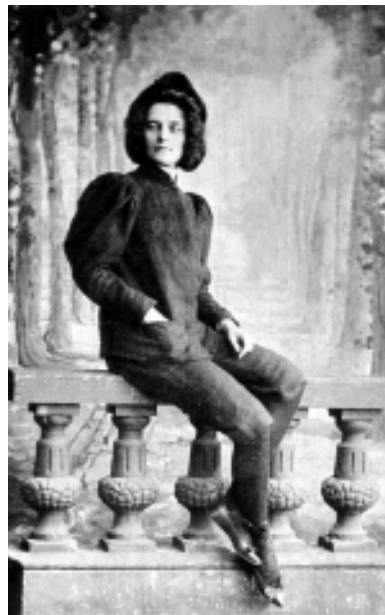
Gippius in masculine attire

In other words, through gender fluctuation, through desire for something inaccessible, as well as through the workings of the poem’s lexicon, the text posits a divided speaker engaged in an ongoing desire for future fulfillment. “ Pesnya ” functions in a genderless plane of discourse where the stable position of the speaker is put into question and undermined, so that the dynamic poetic