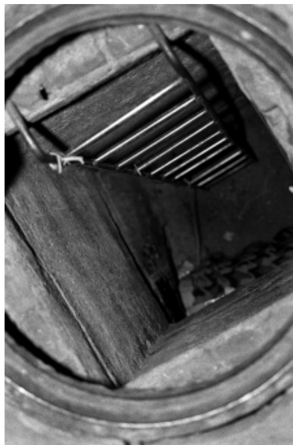
The system of sewer tunnels below the Brincoveanu station is accessed through a string of manholes. Below, the kids have set up Spartan—but generally quite clean—homes.

In the day-to-day, the kids mostly just sat around the platform of their little station and huffed Aurolac, a