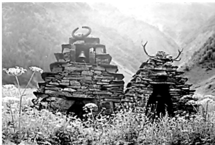
Sacred shrines decorated with antlers of ibexes and deer. Amgha village, Khevruei district, Georgia.

Before the disintegration of the Soviet Union, interethnic relations in this region were quite stable. Later, conflicts in Georgia and the Caucasus 11 influenced the situation of the local population in the Pankisi Gorge and the Akhmeta district as a whole. Relationships between the Ossets and Georgians and between the Kists and Ossets became tense. They are still tense today. The Osset inhabitants are sympathetic to the Chechen refugees, whom they see as protecting them against oppression by the Kists. The Ossets feel pressured by the Kists and have been leaving their villages in the Pankisi Gorge to resettle in Northern Ossetia. Because they often cannot sell their properties, they leave behind cultivated lands and houses built over many generations. Kists and Chechen refugees have settled in these abandoned houses. In this manner, the Osset villages of Dumasturi, Kvemo Khalatsani, and Tsinubani were vacated from 1998 to 2002. Currently, the dwellers of the village Koreti are also preparing to leave. According to one local dweller there is no other choice: Kist criminals took her son’s car. Then one night, criminals armed with automatic guns terrorized the family. Not finding any money, they took the family cow. 12