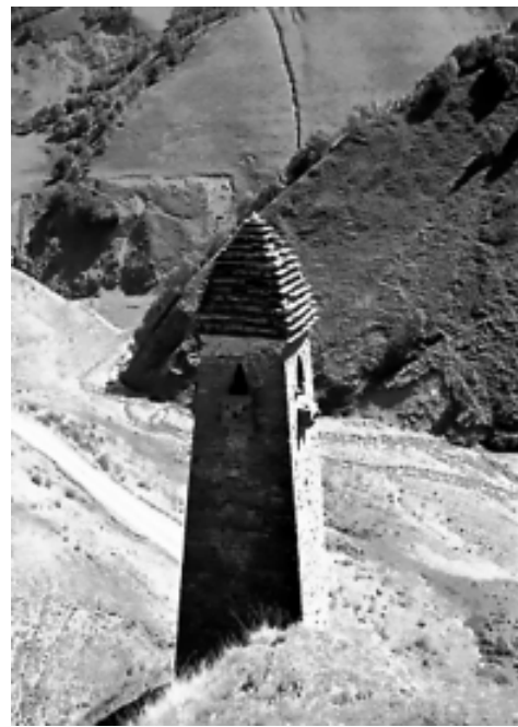
Watch tower, Khevsureti. This type of watch tower is widespread in the Central Caucasus.

It seems that the non-Kist population of Pankisi must turn to Georgian and Osset mafia organizations for protection. Needless to say, rivalry between different ethnic mafias will only worsen the already tense situation in the Gorge. Usually these groups have influential allies and protectors in the criminal world of Tbilisi,