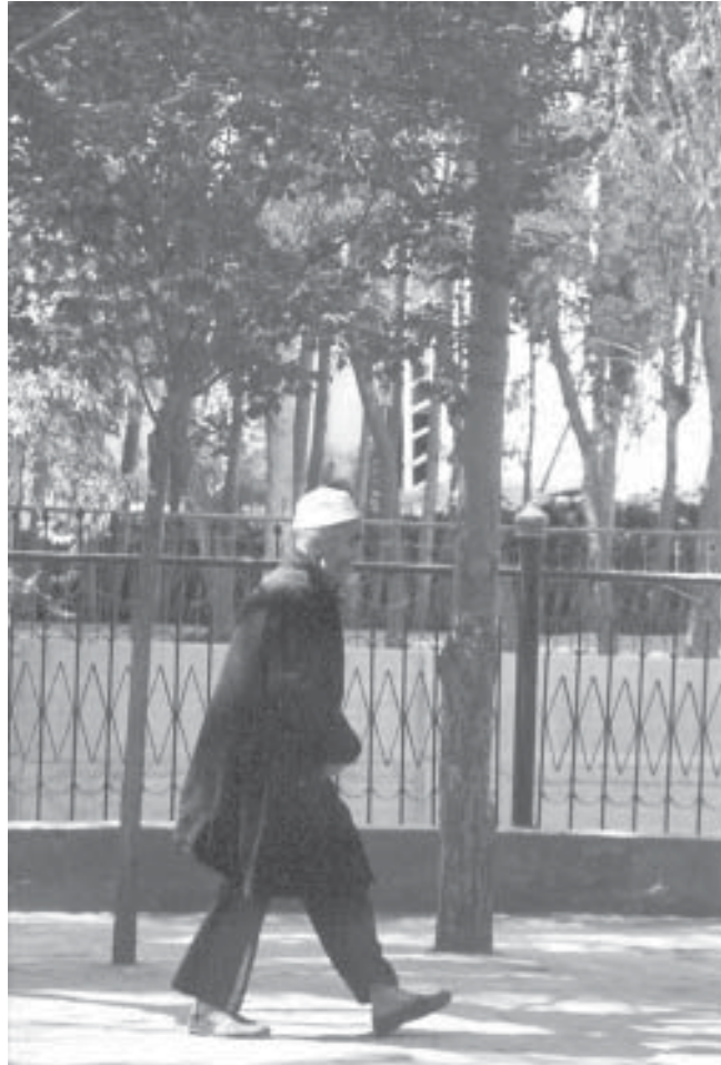
Muslim in Kashgar

The picture is not altogether grim, however. This year, after long consultations with the United States CDC and NIH, China adopted policies that greatly surpass those of the US in terms of the treatment of heroin addicts. China plans to distribute no less than 500,000 sterilized syringes for free each day and will create thousands of methadone clinics throughout the country. Previous to this, China's main treatment method was to incarcerate heroin addicts for up to three years and force them to go cold turkey. That was a tremendous failure. Unfortunately, SARS hit just weeks after China adopted its rather dramatic and far-reaching plan. Most HIV/AIDS work in China went on hold. And the Chinese government still appears to maintain the dangerous view that HIV/AIDS in Xinjiang is a Uyghur disease, reflecting the moral depravity of Uyghur society. While SARS will probably not be China's undoing, should the Chinese government continue to believe that Xinjiang's AIDS epidemic is a Uyghur disease, it is very possible that AIDS in Xinjiang will indeed become China's Chernobyl.