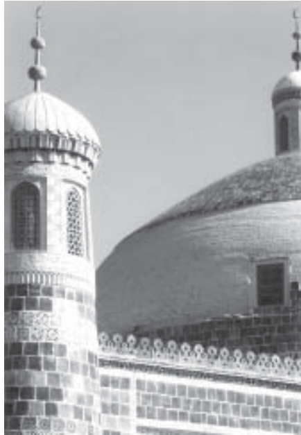
Tomb of Apak Hoja, Kashgar

perceived a growing Islamic threat from Central Asia, Pakistan and Afghanistan and the alliance gave China extreme latitude to crack down on all Xinjiang Uyghurs thought to be involved in anti-government activities. It was only two months after the first Shanghai Five meeting in 1996 that China unleashed for the first time its Strike Hard campaign against Uyghur "separatism." The Strike Hard policies have led to a cycle of Uyghur anti-government resistance, alternating with harsh Chinese military retaliation that continues today.