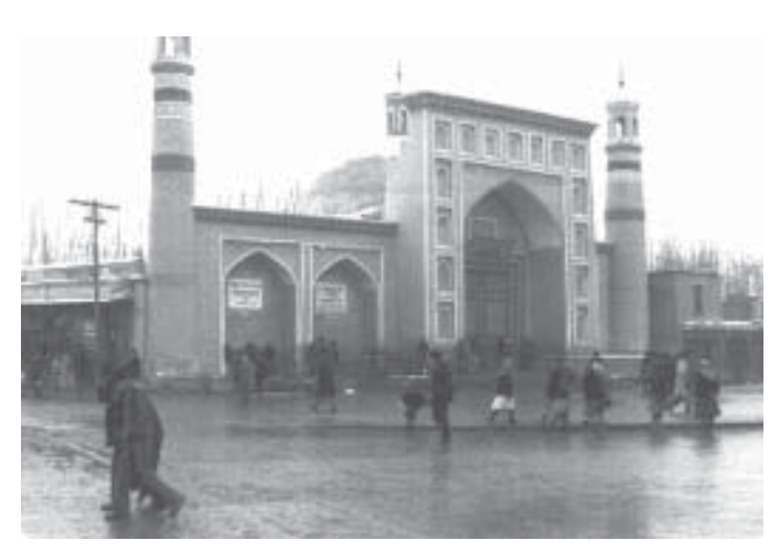
The Id-Kah Mosque in Kashgar dates from the 15th century and is an important religious and historic landmark within the region.

While in Urumchi, people often asked if I had been to the Big Bazaar, a new mall with Islamic-style architecture and a minaret that you can go to the top of for good views of the city. Amidst the impressive buildings surrounding the large square, there was indeed a KFC colonel smiling down at me. But it