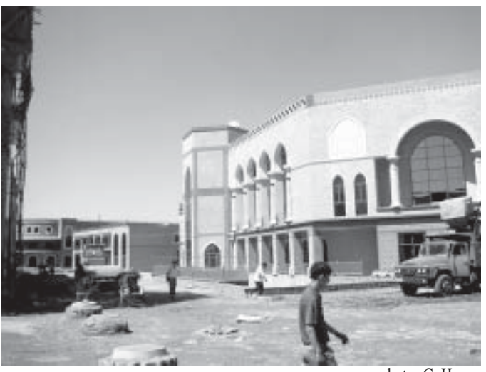
Recently constructed "quasi-Islamic" style buildings near the Id-Kah Mosque, Kashgar.