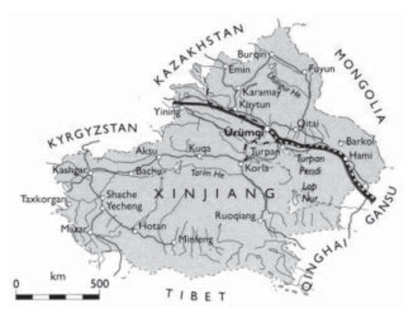
Cindy spent time in Urumchi and Kashgar. The Xingjiang-Tajikistan border is located to the southwest of Kashgar.

I quickly realized there would be a big difference between speaking a few sentences and understanding a few. More than other languages I have studied, Uyghur transforms when spoken quickly: sometimes it seemed the vowels would just disappear. Despite my fumbling and inelegant rendering, people were delighted that I tried to speak as much Uyghur as possible. Once at a small chaykhana (teahouse) in Kashgar I met an elderly woman who had been watching curiously as I ordered in Uyghur. My friends and I savored black tea and Central Asian-style bagels with creamy honey. As I was leaving I smiled at her and said, "Kashgar is beautiful" in Uyghur. To my disbelief, she replied, "No, it is your Uyghur that is beautiful." Although she was only being polite, I didn't stop smiling for days. By the end of my time in Kashgar, I decided not only will it be an ideal field site, but I will go for a year of language training before starting my research. Unlike in northern Xinjiang, where most people speak Mandarin, many of the people I met near Kashgar spoke little or none. Though it is easier for me to speak Man-