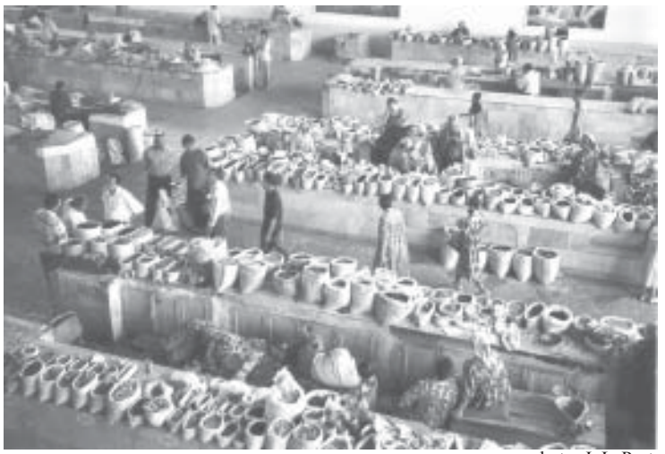
Spice market in Samarkand.