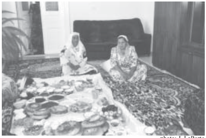
Wedding banquet, including non (a round bread), seasonal fruit, and meat dishes.

My host sister's marriage had been arranged by her parents, a common practice in Samarkand. This tradition is changing slowly in Uzbekistan, especially in Tashkent, but in most parts of the country weddings are still arranged by the families. Her fiancé had been introduced to the family by her uncle and once the engagement had been agreed upon, the two were allowed to "date". Such dates usually entailed going for walks together, although they also went to the movies and attended their own friends' weddings. The wedding consisted of a series of ceremonies that were conducted over the course of one week. Some of the events were traditional Uzbek ceremonies, while others were more modern, such as the signing of the official paperwork at the State Registry and the exchange of rings. The wedding also consisted of both