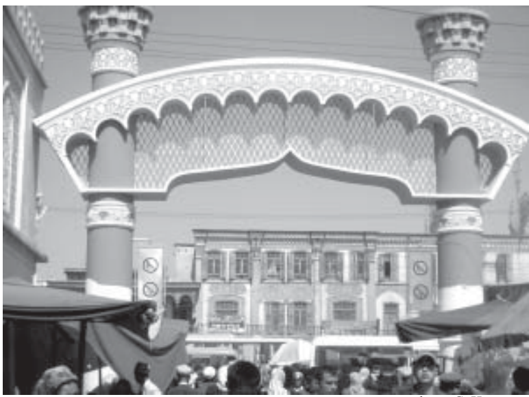
Entrance to the Old City, Kashgar.