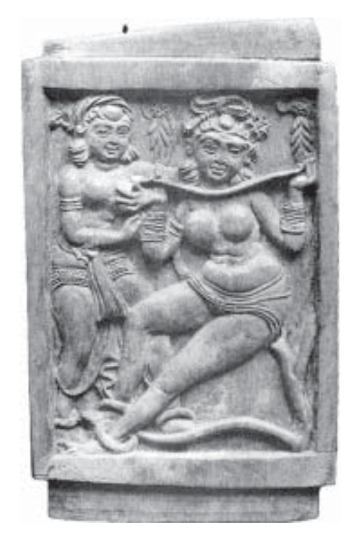
Begram ivory, first century CE.