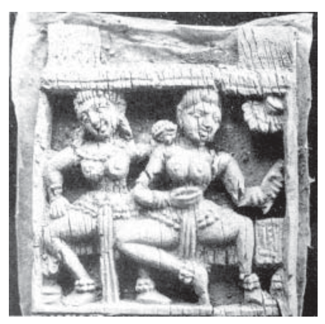
Begram ivory, first century CE.

Research on the archaeological context of the objects, however, and comparative stylistic analysis, suggests another set of hypotheses for these carvings and their setting: that instead of a royal city, the site may have been a trading center