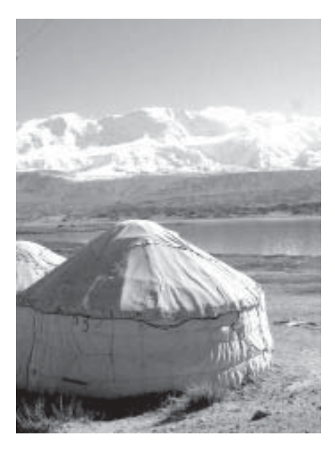
Yurt near Lake Karakul, Xinjiang.

Kazakh lives to explore how nomadism troubles efforts of the nation-state to categorize and monitor its citizens. Moreover, Kazakh culture's continued emphasis on genealogy and tribal descent challenges the Chinese state's efforts to consolidate them into a unified and official minority. In a sense, the Kazakh experience prefigures the postmodern nation-state that faces increasing influence of non-state actors, as well as alternative and relational conceptions of belonging.