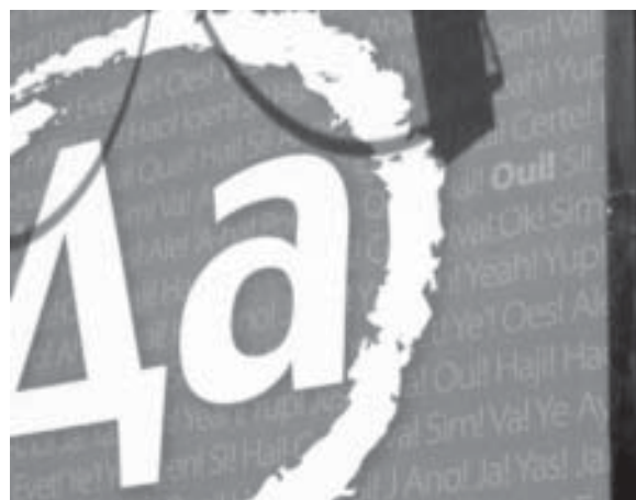
Pro-independence advertising: “Yes!”

During the run-up to the referendum, with the federation of Serbia and Montenegro seemingly poised to dissolve, I was also interested in the Serbian perspectives. However, from reading some of the major Serbian daily newspapers such as Politika , it appeared that the main problem was not the potential of losing Montenegro—this seemed to have been taken for granted, at least in the few days leading up to the referendum. Instead, some issues discussed included what to do about the license plates that read “SCG” (“ Srbija i Crna Gora ,” or “Serbia and Montenegro”) and the necessity of issuing (and affording) all new license plates. One Serbian newspaper, the Novi Sad Dnevnik , countered Montenegro’s independence referendum with its own, posing the question applying to Serbia: “Do you want the Republic of Serbia to be an independent state with full international and legal privileges and sovereignty?” 5 As the referendum fell during the time of the World Cup, and Serbia and Montenegro played together on a team, there was a lot of speculation about whether they would continue to play on the same soccer team if indepen-