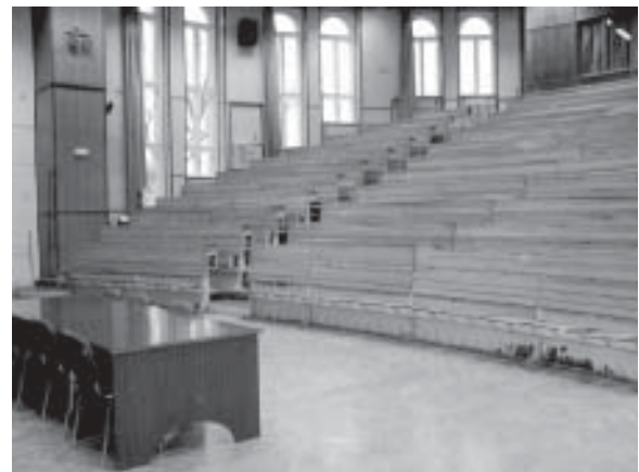
The auditorium in which MEFESZ was founded at Szeged University.

The bold efforts of the students who founded the independent organization MEFESZ directly conflicted with Party ideology and sparked the short fuse to revolution. At