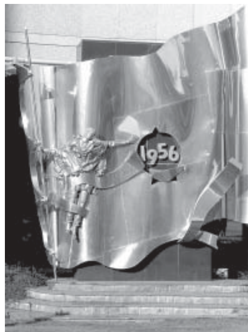
A 1956 Revolution monument in Budapest.

Many intellectuals, though frustrated with the Party, retained their membership in hope of reforming the system. "Really, we young members and young intellectuals in the Party wanted to correct everything. We believed socialism can be corrected." 15 Members of the intelligentsia who joined the Party gained some privileges through Party membership, but they remained under the regime's control. 16 The Writers' Union employed Party language while propos-