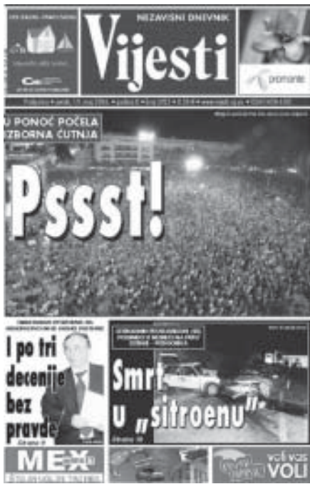
The Newspaper Vijesti, violating the “pre-referendum silence,” printing information about the May 18 th Independence Rally

cars had circled around twenty times or more, each time they passed there was the same excitement. There were cars with four people in them, each holding a flag, and cars with people hanging out the sunroof waving them. A young man was perched half-outside one car with his legs through the window, wearing the red and gold flag as a cape that fluttered out from his shoulders as they whipped around the city. People were all in the streets and ended up in cafes and bars all night, celebrating the victory, and on television programs flashed between celebrations in the major Montenegrin cities and how they were celebrating. Most impressive was in Cetinje, the former capital of Montenegro, where folkdances in traditional costumes were performed all through the night. Podgorica was once again bathed in fireworks. During all of this, the pro-unionists must have remained inside since there was nothing heard from them.