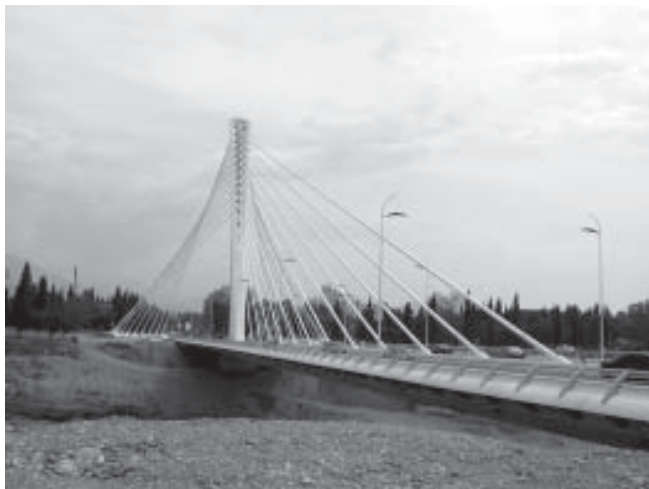
Podgorica's Millennium Bridge

“Montenegro is not for sale!” (“ Crna Gora nije na prodaju! ”). On television, this forceful statement was explained to mean that Montenegro was not to be sold to foreign investors (for example, many Montenegrins express alarm that “half of the Montenegrin coast has been bought up by Russians”). However, it seemed to me that Montenegro “not being for sale” might have been a way of criticizing the vast amount of European Union funding that has recently been poured into Montenegro, possibly to “buy” the country away from Serbia. For example, many Montenegrins had been upset that Serbia had not built them a satisfactory airport, and then the EU funded the construction of a new airport in Podgorica that opened May 17 th , four days before the referendum. In addition, a mix of Montenegrin and European funds went to the building of the spectacular Millennium Bridge ( Most Milenijum ) over the Moraca River in Podgorica. This bridge, which opened on the National Day of Montenegro (July 13, 2005), has been analyzed in the Montenegrin press as a visible symbol urging Montenegro to modernize—and to Europeanize.