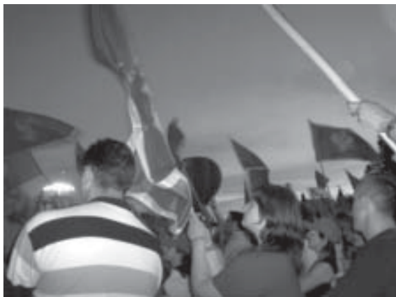
Supporters at the Montenegrin Independence Rally, May 18, 2006

Other concerns involved the reconstruction of the Serbian government, as the Serbian finance minister Mladjan Dinkic discussed publicly on May 17 th . 7 Much more pressing for Serbia was the issue of Kosovo. Montenegrins and Serbs are very similar—physically, religiously, and linguistically (and many claim that Montenegrins are, in fact, Serbs). Some Serbs had feared that if Montenegro gains independence, it would be more difficult for Serbia to justify keeping control of Kosovo (about 80% of whose inhabitants are Muslim). This summer, many newspapers were predicting that by November 2006 Kosovo would become independent, and along with this Serbian media discussed repercussions, such as the flight of Serbian refugees from Kosovo into Serbia and the paths they would take (which were traced on a map with arrows).