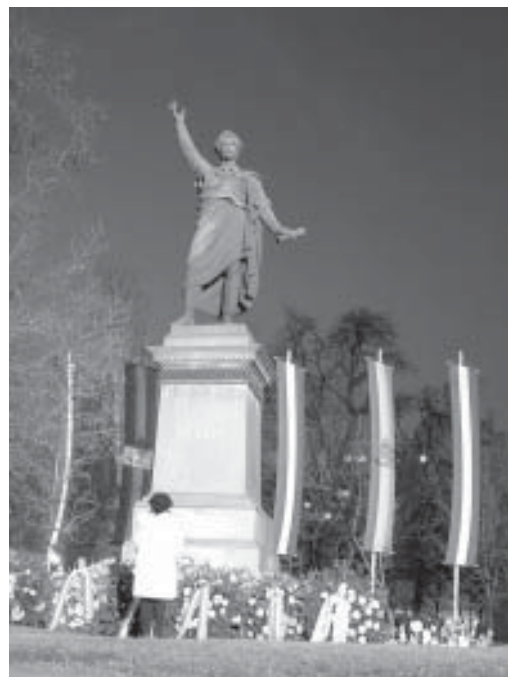
Petofi Statue in Budapest on March 15, 2005. Flags and flowers grace the statue, commemorating the 1848–49 Revolution.

Every March 15, Hungarians grace Petofi's statue with flowers and national flags to remember his brave actions against the Habsburgs and his inspiration for the Revolution of 1956. The Petofi Circle, the young intellectual circle in 1956, named itself in his memory; it hosted public debates in which experts and students publicly discussed national issues. Whereas the Party would have arrested and executed people for such activity a few years earlier, the Party helped found the Petofi Circle in 1956 through the Union of Working Youth (DISZ). 28