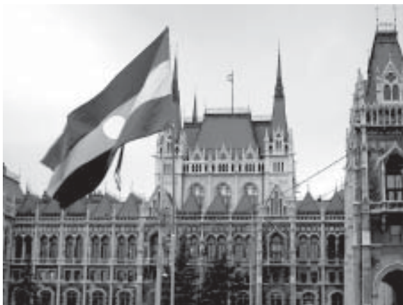
A 1956 Hungarian flag outside the Hungarian Parliament in Budapest. During the revolution, Hungarians cut the Soviet symbol out of the nation’s tri-colored flag. Today, a replica flies over a 1956 monument in front of Parliament.

These arrangements gradually began to break down in Hungary after the economic crisis of 1951 revealed flaws in the system. While Stalin was alive, the Party never would have tolerated public criticism. But political relaxation after Stalin’s death in 1953 created conditions that facilitated the implementation of the New Course, critical publications in the daily paper, public meetings of the Hungarian intelligentsia, and Khrushchev’s Secret Speech in the Soviet Union. All of these circumstances contributed to the delegitimization of Party authority which contributed to the outbreak of the Hungarian Revolution in the fall of 1956.