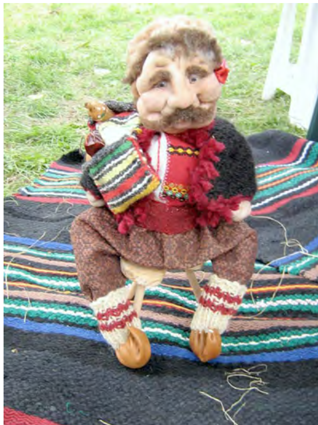
Example 4 - handmade Bai Ganyo doll (Krūsteva)