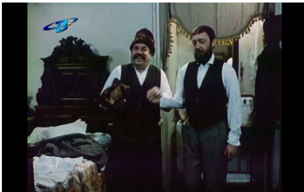
Example 2 - Bai Ganio happily engages his reluctant Bulgarian roommate in a folk dance (Nichev & Stoianov)