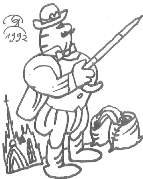
Example 6 - illustration by Boris Dimovski accompanying book of literary criticism (Benbesat 20)