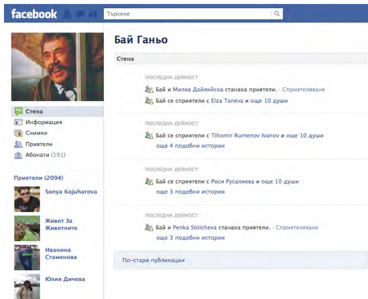
Example 3 - Bai Ganyo's Facebook profile (Facebook)