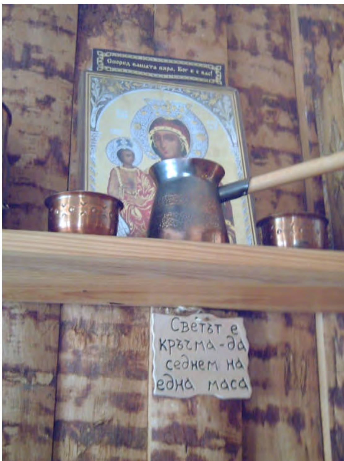
Example 9 - "Bai Ganio" restaurant in Majorca, Spain (Dimitrov)