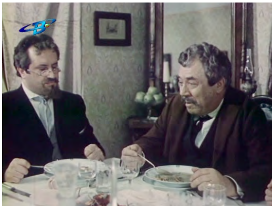
Example 1 - Bai Ganio slurps his soup while his Czech host attempts to maintain his patience