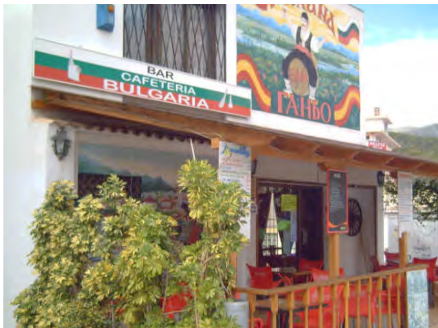
Example 8 - “Bai Ganio” restaurant in Majorca, Spain (Dimitrov)