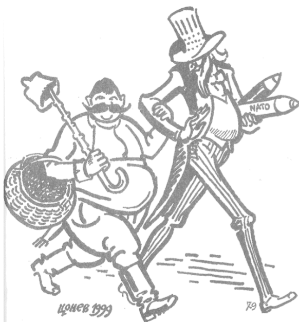
Example 5 - political cartoon with Bai Ganio joining Uncle Sam and NATO (Tsonev 137)