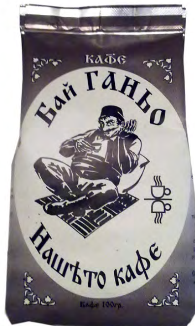
Example 7 - “Bai Ganio coffee - our coffee” (Viva AiM)