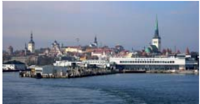
View of Tallinn from Helsinki.

The words of yesterday perhaps no longer serve today. Currently, there is a growing contingency who argue that "Eastern Europe" is no longer an accurate description of,