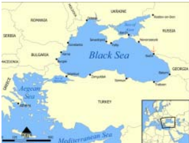
The Black Sea Region

In the years between the Caucasian War and World War I, the numbers of inorodtsy (a term for national minorities) in the region were quite high, and Russian peasants were lured to settle in the area by the promise of fertile land. At this time, Sochi had a remarkably diverse ethnic population: Greeks, Estonians, Armenians, Moldovans, Germans, and small numbers of the original Caucasian population (by the turn of the century, Caucasians numbered possibly a tenth of the Russian population). In 1911, a community of exiled Old Believers was given land in Sochi by imperial order and their descendents remains in the city to this day. Armenians fleeing Turkey also re-settled in the region. Growth was slow enough, however, that in 1898 the Imperial Commission studying the Black Sea coast of the Caucasus noted smugly that "We Russians know so little of our own Fatherland—for example, the Black Sea coast with its rich natural conditions remains unknown and is not being put to use." Not long after this reproach, Sochi's growth took off as sanatoria and health spas were opened down and up the coastline (Sochi is reputed to be the "longest" city in the world), all touting the benefits of the area's unique admixture of humid, oxygen-rich, pristine air and its ecologically diverse environment, its subtropical maritime landscape separated from pristine mountains by a narrow forest belt.