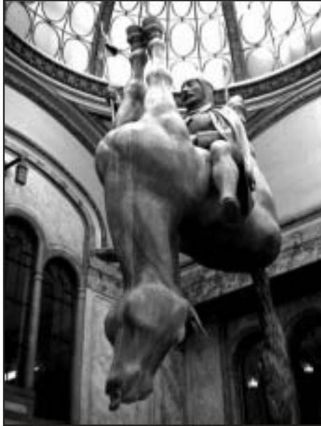
Saintly Prince Wenceslas Riding a Horse, David Černý (sculpture, 1999)

An exhibition, lectures, and films focused on the explosion of interest in real and imagined pasts, especially medieval pasts, since 1989, from Estonia in the north to Bulgaria in the south.