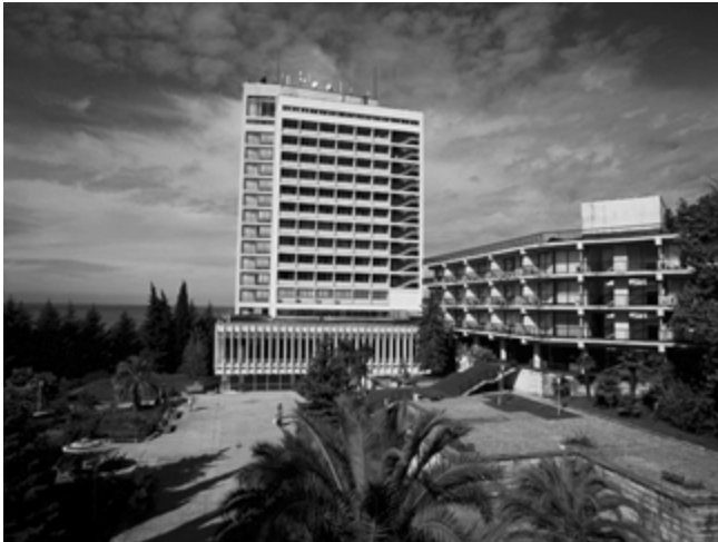
Sanatorium "Zelyonaya Roshcha"

patron Mikhail Zinznov, catered to an elite class of holiday-goers and health-seekers. This same sanatorium compound was later commandeered by the Soviet elite for their own holiday escapes. Stalin ordered his personal architect to build a private dacha on the grounds to his specifications: low-ceilings and natural wood, all sealed within a camouflaging green exterior invisible from air or sea. Today, in a leering example of post-Soviet capitalism, Zelyonaya Roshcha has converted Stalin's dacha into a luxury hotel where modern holiday-makers, for the modest sum of 2,100 rubles per night, may stay in Stalin's private rooms, sample his favorite Georgian dishes, and gaze on family photographs left untouched since the leader's death.