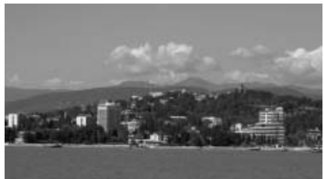
View of Sochi from the Black Sea