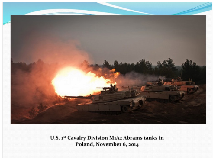
U.S. 1st Cavalry Division M1A2 Abrams tanks in Poland, November 6, 2014

In early October, the nature of these plans was fleshed out when the Army announced that it was assigning the 1st Brigade Combat Team of the U.S. 1st Cavalry Division, the home base of which is Fort Hood, Texas, to the U.S. European Command.