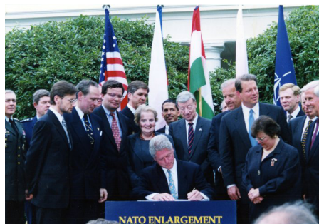
President Clinton signs NATO enlargement treaty, May 21, 1998, bringing in Poland, the Czech Republic, and Hungary

I also believe that the West has contributed to the current crisis. In saying this, I am not arguing that the West is solely, or even mostly, to blame. But I believe the West has mishandled Russia, and that its post-Cold War Russia policy has been unwise and insufficiently risk averse. There has been too much hoping for the best and not enough planning for, and trying to avoid, the worst.