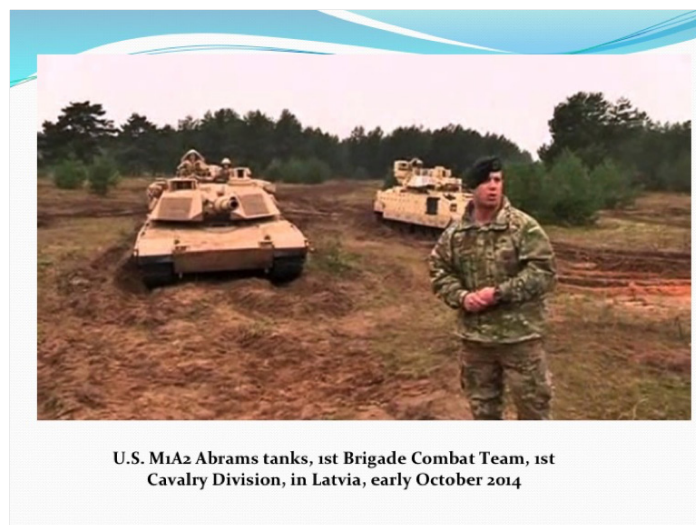
U.S. M1A2 Abrams tanks, 1st Brigade Combat Team, 1st Cavalry Division, in Latvia, early October 2014

Meanwhile, the U.S. military has taken a number of its own “assurance” and “deterrence” measures in the east. It has increased military assistance to NATO’s eastern member-states, including increased training exercises and interoperability assistance. “Rotational” U.S. Army small units are to remain in Poland and the Baltic states at least until next year and perhaps beyond. (These troops would then “rotational” only in the sense that they would not use permanent bases, with all the associated costs, including family housing, and would be in theater for relatively brief periods before being replaced.)