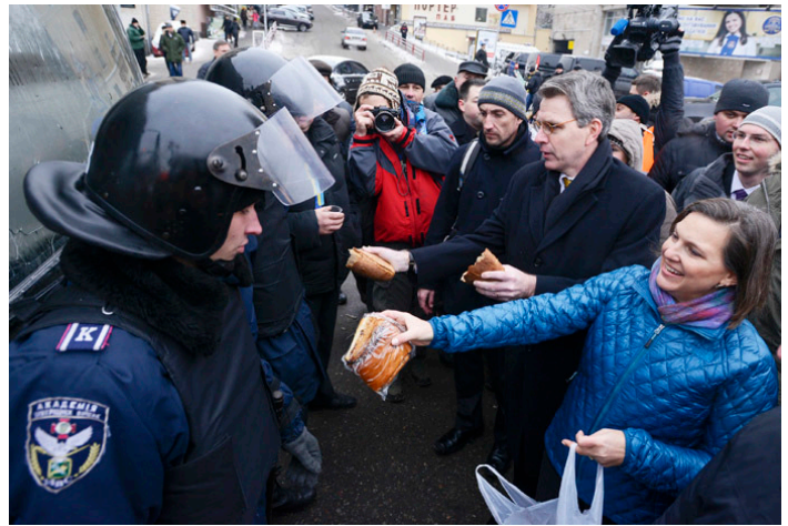
U.S. Assistant Secretary of State Victoria Nuland hands out cakes to Maidan protesters, Dec. 10, 2013

Let me turn finally to the U.S. policy response to Russia's role in the Ukraine crisis and begin with four general points.