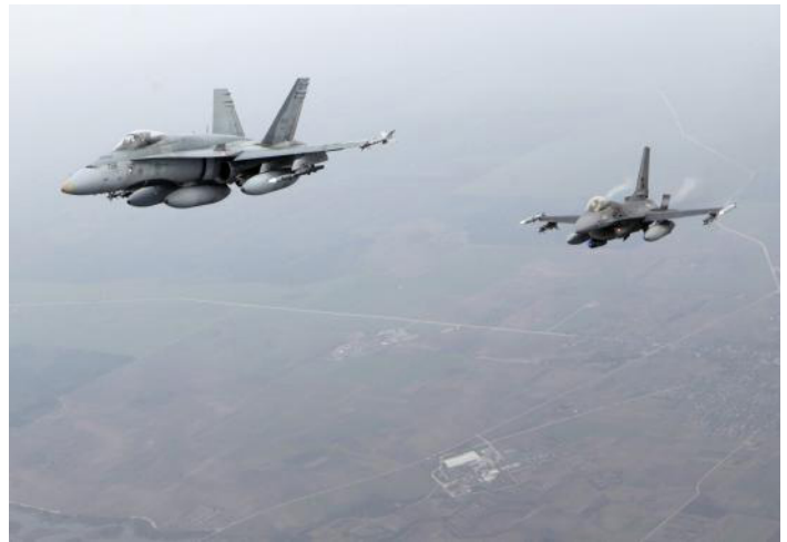
Canadian Air Force fighter CF-18 Hornet (L) and Portuguese Air Force fighter F-16 patrol over Baltic air space, from the Zokniai air base near Siauliai, Lithuania

Among other measures, NATO reinforced its Baltic Air Patrol (the number of rotational fighter jets has gone up from 4 to 16). Those jets, which had been stationed in Lithuania, have begun using airfields in Estonia and Latvia. NATO naval vessels