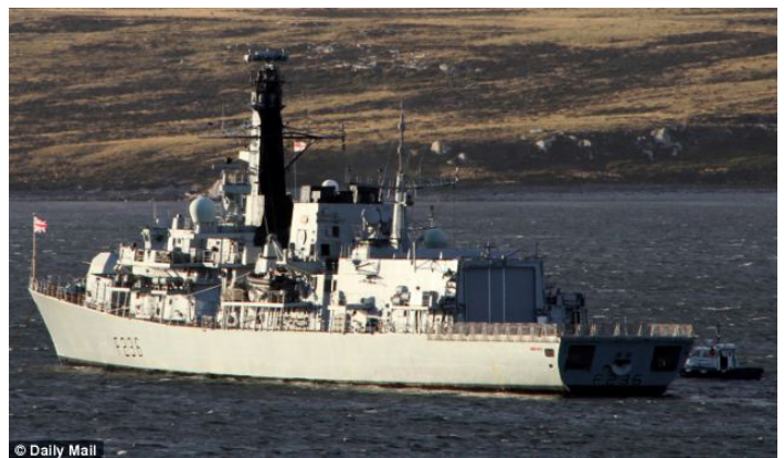
U.K. frigate intercepts Russian vessel in the Baltic Sea, June 24, 2014

In addition, NATO agreed to improve its existing Rapid