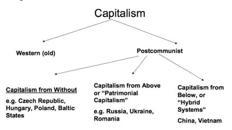
Figure 2: King and Szelenyi's Typology of Post-communist Capitalism

Szelenyi still find the liberal market economy (LME) salient, as the Central European "capitalism from without" characterizes what they call a "liberal dependent type of capitalism" with large flows of foreign direct investment (FDI) through multinational corporate investors and a stable state capable of providing public goods.<sup>25</sup> King and Szelenyi's alternate typology is illustrated in Figure 2 below.