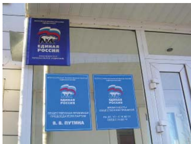
"Putin's Public Reception" held at the United Russia party headquarters.

Based on my interviews with political party leaders, local legislators, and average individuals, it appears that the Krasnoyarsk regional government is attentive to constituents' concerns, and citizens actually seek out regional deputies and party members to address their problems, a phenomenon I have observed less frequently in other parts of Russia. One of the most organized forums for providing constituent feedback is "Putin's public reception (priem Putina)," which is held in the headquarters of the regional branch of the United Russia