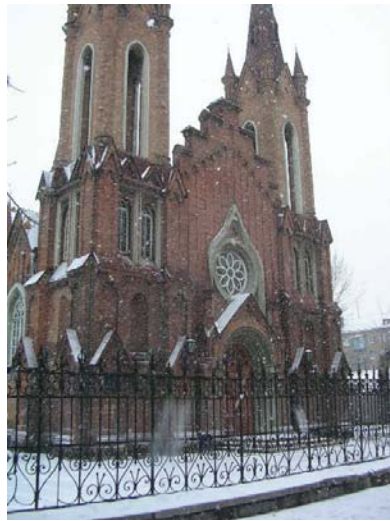
The Roman Catholic church in Krasnoyarsk, also known as the Krasnoyarsk Organ Hall.

The city's diverse social fabric is visible in the physical structures that symbolize parts of the regional identity, like the new mosque under construction in a booming residential neighborhood or the Old Believer villages that dot southern parts of the krai. Another symbol of the region's complex social past and present is the Roman Catholic Transfiguration Chapel, more widely known as the Krasnoyarsk Organ Hall. According to a display in the regional museum, the church was built by the region's Polish community in 1911—a large Polish population had emerged as a result of exile and banishment from other parts of the Russian Empire. The building was nationalized in the early 1920s, and it was used for other purposes until the Krasnoyarsk Philharmonic installed an organ in it in the 1980s. While the building's primary function remains a performance space, since 1993 the local Catholic community has been allowed to hold religious services there. The congregation is large enough to meet a demand for Sunday Mass in Russian, German, and Polish.