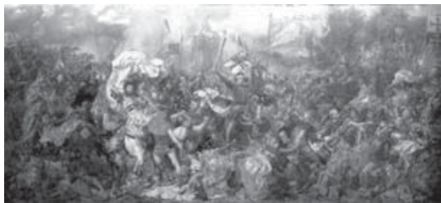
Dia 1: Jan Matejko, Battle of Grunwald, 1878

his epic, Krzyżacy ( Teutonic Knights ), which circulated in newspapers from 1897 to 1900 and was published in novel form in 1901 (which became mandatory reading in the classroom after WWI). 9