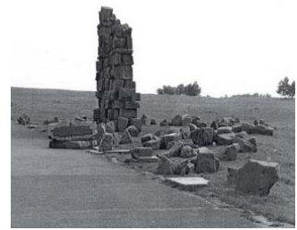
Dia. 5: The Destroyed Monument, Grunwald

It would include a museum/ archeological site dedicated to the 1410 battle and would also contain the Destroyed Monument (dia. 5). This monument is of particular interest, since it was constructed from 27 stones remaining from the original 1910 monument, which was destroyed in 1939. The Jagiełło monument was likewise replaced in Kraków after WWII. This time, however, it was called the Grunwald Monument and had the grave of the Unknown Soldier placed immediately in front of it (dia. 6). 23