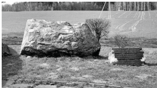
Dia. 2: Jagiełło Stone, Grunwald

In reaction, less than a year after the publication of the book, German nationalists revealed a memorial to grand master Ulrich von Jungingen. The memorial crag – which was previously known as the Jagiełło Stone (dia. 2), and which was found on what was believed to be the battlefield of Grunwald/Tannenberg – was two meters tall and was inscribed with words of respect to the fallen grandmaster: "In the fight for German existence and German right, Grand Master Ulrich von Jungingen died a heroic death here, 15 July 1410." The stone was placed on the rubble of a chapel that was burned down in 1410, so as to articulate how this German hero fell: a Christian martyr fighting for "German existence and German right" in the East. It was the first monument to Grunwald/Tannenberg.