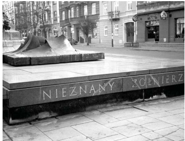
Dia. 6: The Tomb of the Unknown Soldier, Kraków