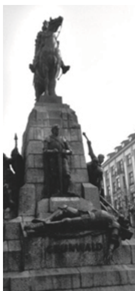
Dia. 3: Reconstructed Grunwald Monument

German forces in 1939) was appreciably larger in comparison to the meager monument to Ulrich von Jungingen in 1901. It stood 10 meters high and centered a larger-than-life-sized figure of a victorious Jagiełło on his steed. In front of the king stood Duke Witold, reigning over a fallen Teutonic knight. Freeing themselves from the chains of bondage, a number of other figures encircled the king. Through the images of these previously oppressed figures, the monument was meant to encourage the Polish nation: despite their current bondage, Poles were destined to be victorious again, just as the king and Witold had been, and their archenemy, just as in 1410, was to be the Germans. There was a huge civilian turnout for the celebrations in Kraków: more than 300,000 people from all corners of the world made an appearance in the town during the time of festivity – forcing the imperial railway service to place a number of new trains on the tracks just to transport visitors to Kraków. 11