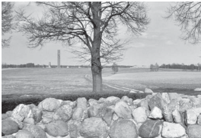
Dia. 4: Battlefield of Grunwald/Tannenberg with monument complex, museum, etc.

The 1960 Grunwald/Tannenberg anniversary would be the largest post-WWII celebration in Poland to date. Official reports claim that more than 200,000 people from all Warsaw Pact countries traveled to attend the ceremonies. This was also one of the first years when, instead of sober ceremonies, hundreds of visitors dressed as knights and reenacted the mythic battle on the field. One reason for the large turnout (and the reenactment) at the celebrations of 1960 was the opening of the film adaptation of Sienkiewicz's Krzyżacy . The novel had been very popular with the Poles at the turn of the century, and the film, directed by the famed Aleksander Ford, became equally popular. The climax of the film showed the battle between the Order and the united forces, with the field of Grunwald in the background. Three years later, the People's Republic would construct a series of monuments at the site of the battlefield (dia. 4).